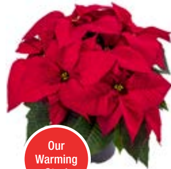
Our Warming Star!

When breeding new varieties, Beekenkamp Plants selects those that will provide reliable results under all conditions. From the production of cuttings, packaging and transport, right up to the retail shelf.