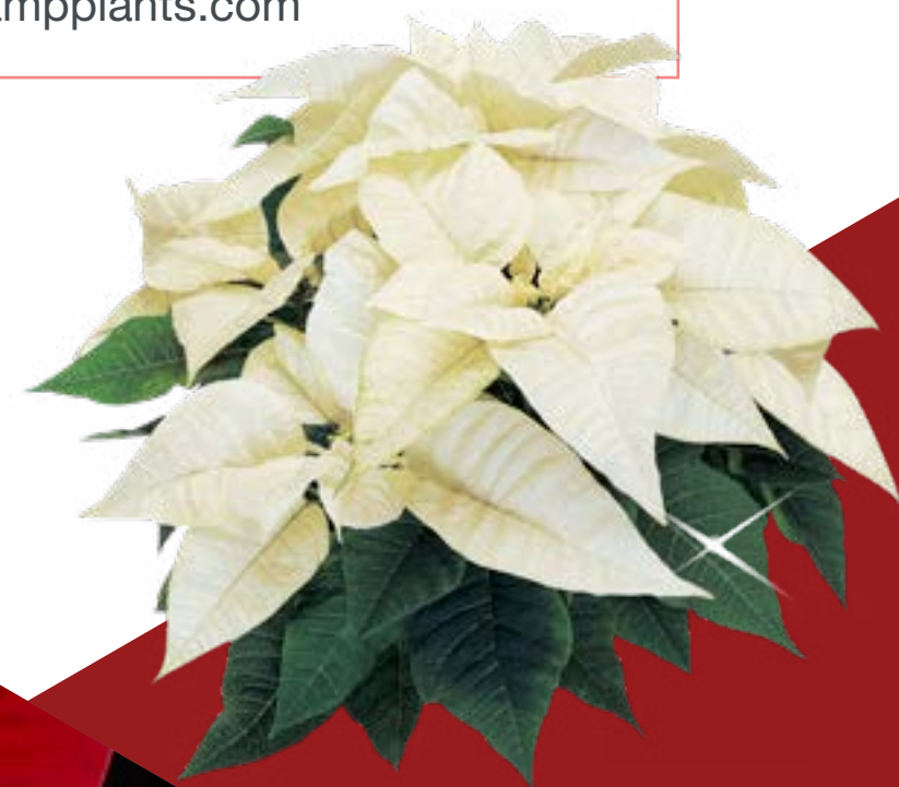
WHITESTAR™ SYNGENTA FLOWERS

VISIT US AT www.syngentaflowers-us.com and www.beekenkampplants.com