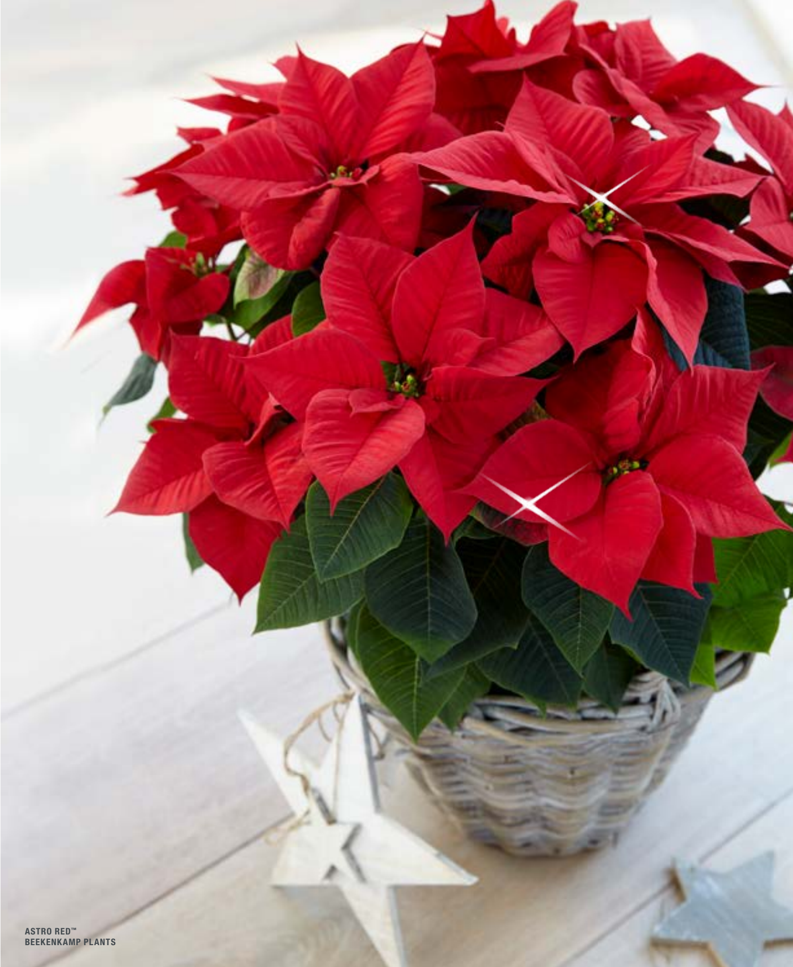
ASTRO RED™ BEEKENKAMP PLANTS

FINISH DATE Nov. 18 – 25 VIGOR Medium – Vigorous HABIT Normal POT SIZE 4 – 10 in