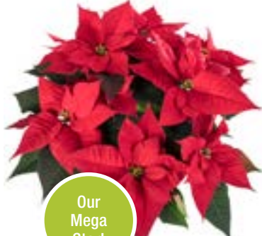
Our Mega Star!