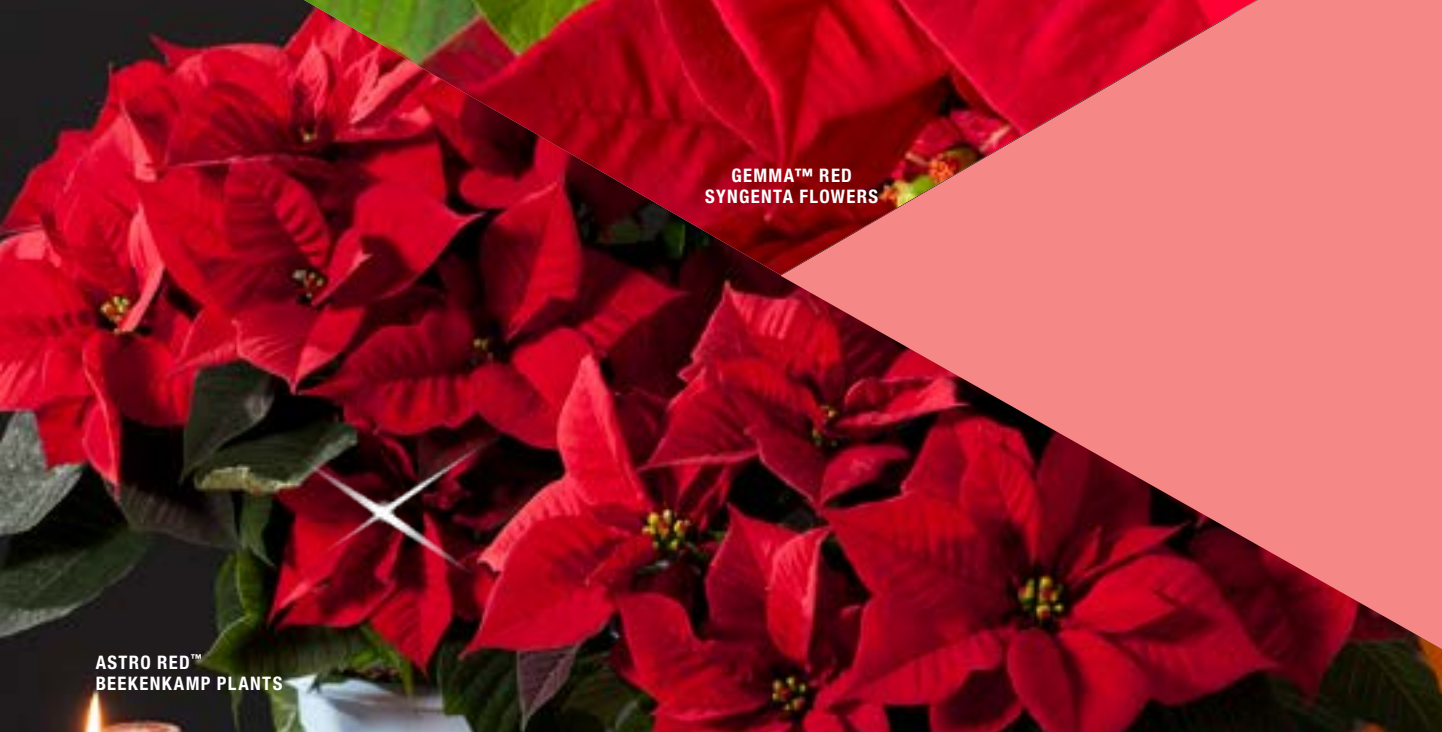
ASTRO RED™ BEEKENKAMP PLANTS

VISIT US AT www.syngentaflowers-us.com and www.beekenkampplants.com