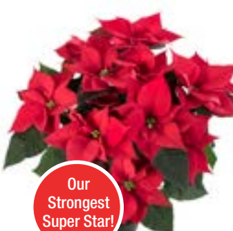
Our Strongest Super Star!