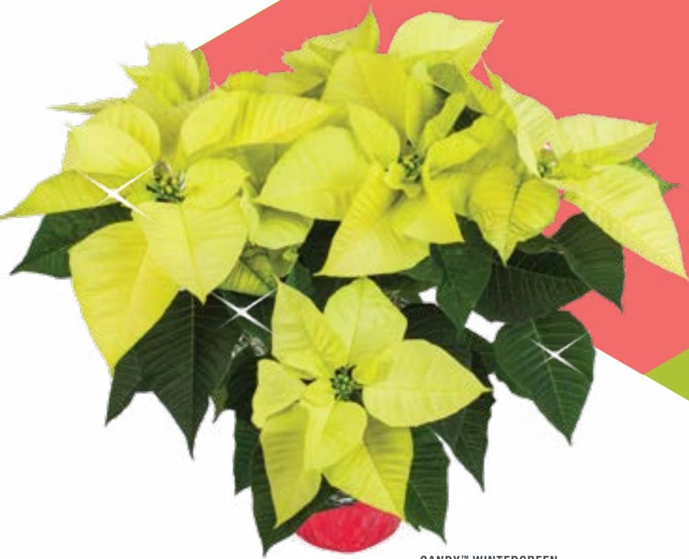
CANDY™ WINTERGREEN SYNGENTA FLOWERS