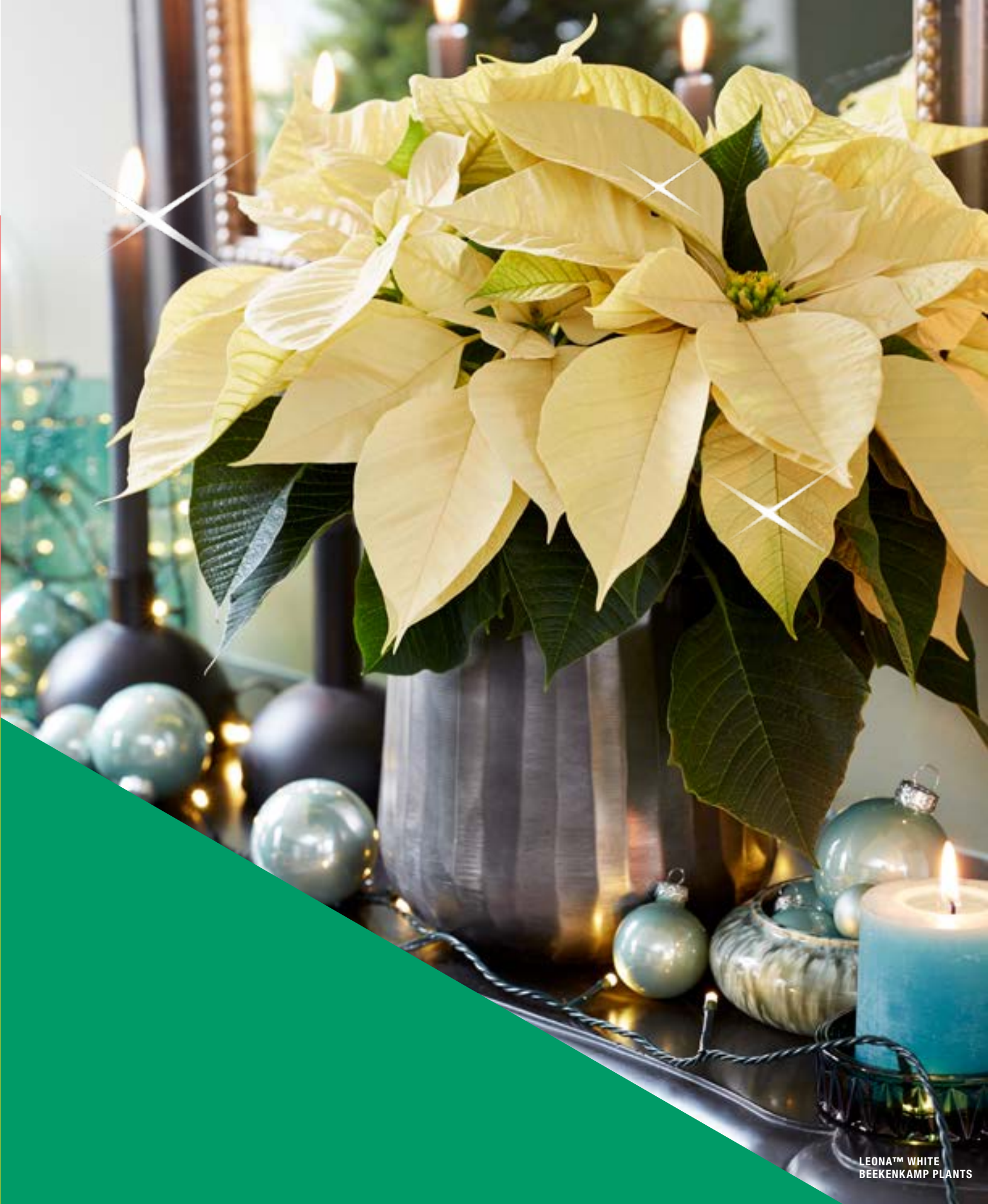
LEONA™ WHITE BEEKENKAMP PLANTS