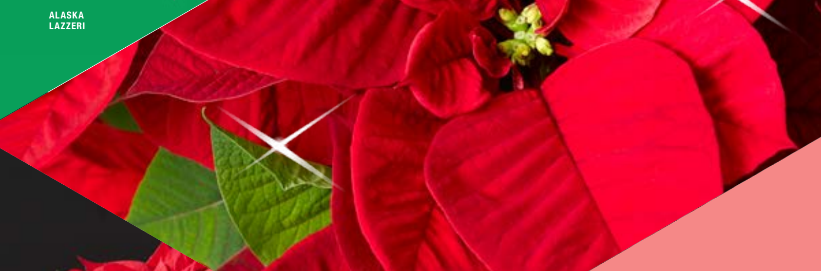
GEMMA™ RED SYNGENTA FLOWERS