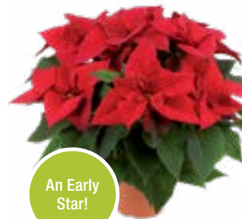
An Early Star!

FINISH DATE Nov. 15 – 22 VIGOR Medium HABIT V-shaped POT SIZE 4 – 10 in