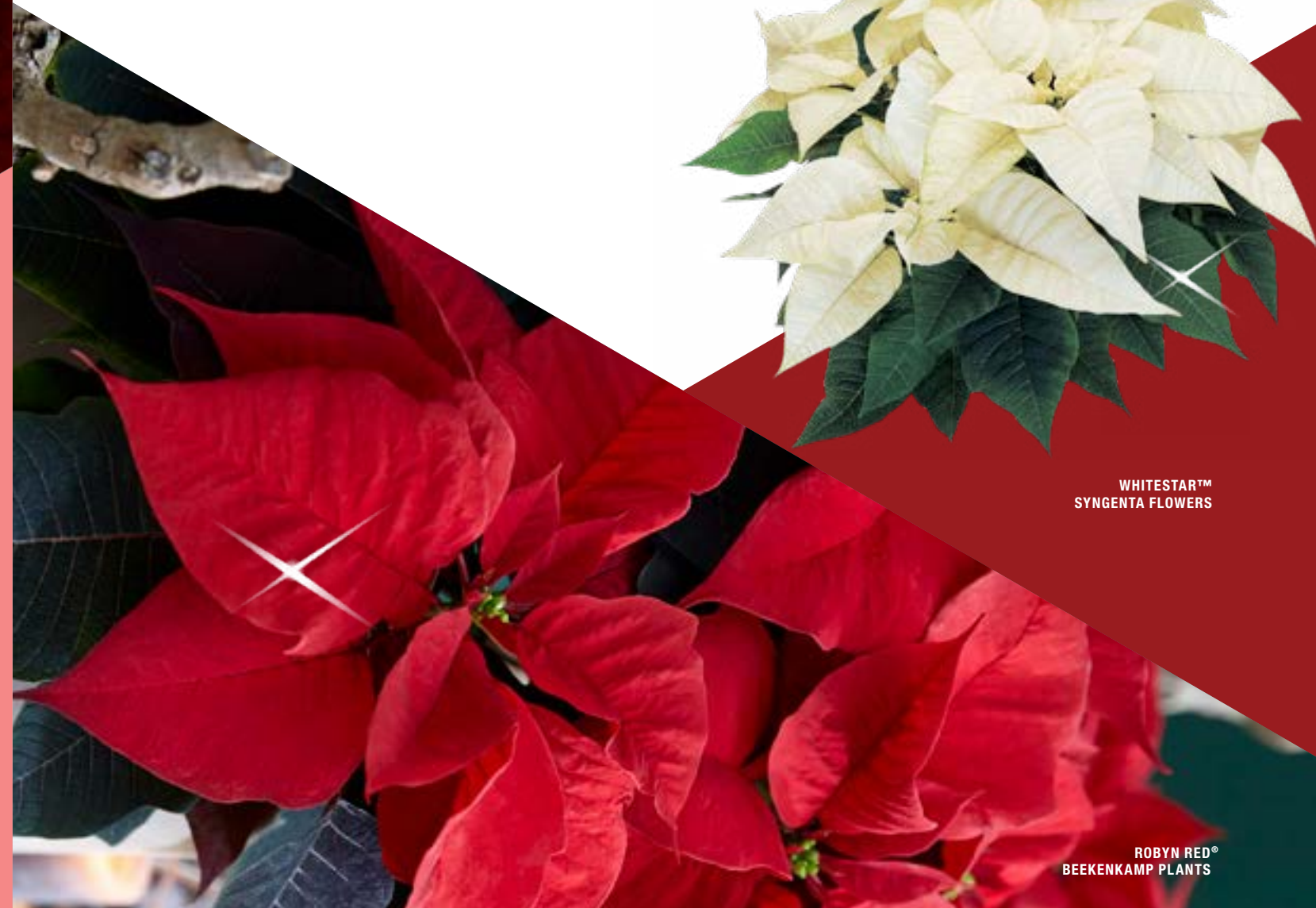
ROBYN RED® BEEKENKAMP PLANTS