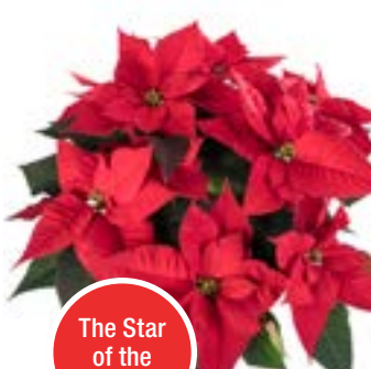
The Star of the Show!