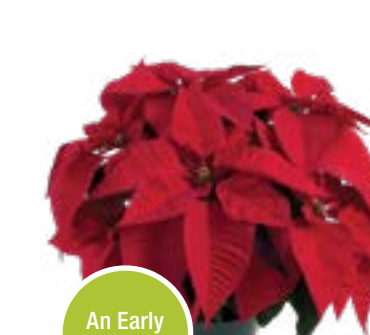
An Early Star!

Syngenta Flowers' poinsettia portfolio represents a range of genetics that are bred for versatility, answering the diverse needs of growers across North America.