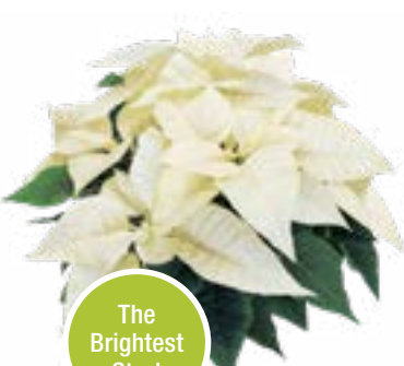
The Brightest Star!