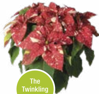
The Twinkling Star!

FINISH DATE Nov. 15 – 22 VIGOR Vigorous HABIT V-shaped POT SIZE 4 – 10 in