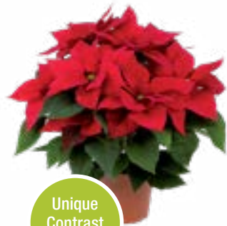
Unique Contrast Star!

FINISH DATE Nov. 18 – 25 VIGOR Vigorous HABIT Very V-shaped POT SIZE 4 – 10 in