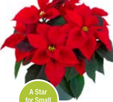
A Star for Small Pots!