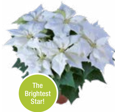
The Brightest Star!

The Lazzeri poinsettia assortment is now available for the first time in North America with 11 excellent varieties offered by Syngenta Flowers.