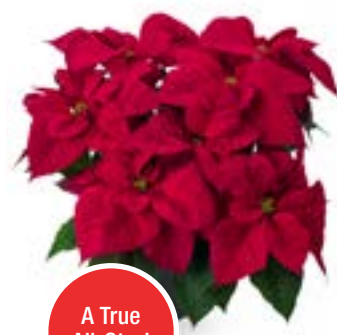
A True All-Star!